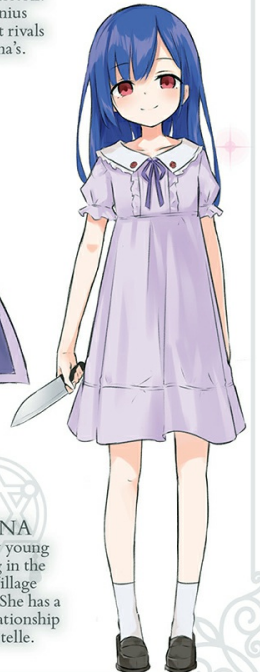
SELENA A wealthy young girl living in the Clock Village of Rostolf. She has a friendly relationship with Estelle.