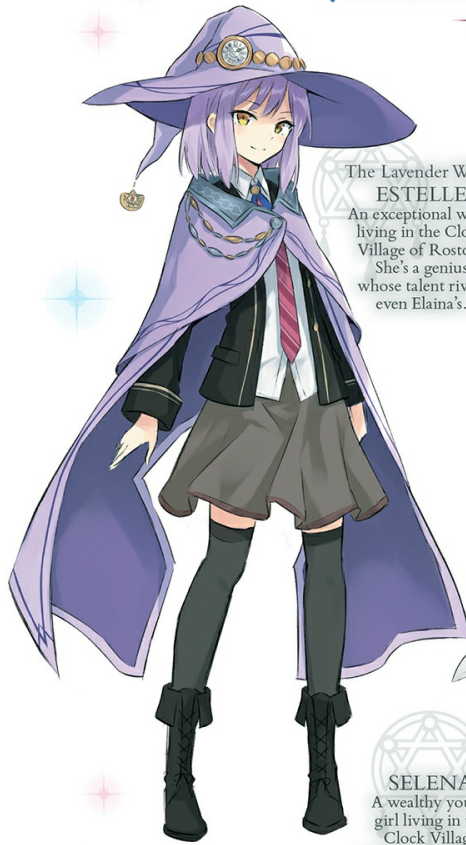
The Lavender Witch ESTELLE An exceptional witch living in the Clock Village of Rostolf. She's a genius whose talent rivals even Elaina's.