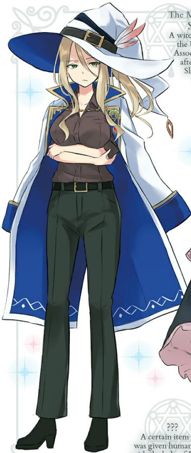
The Midnight Witch SHEILA A witch affiliated with the United Magic Association. Chases after the "Serial Slasher" with Elaina.